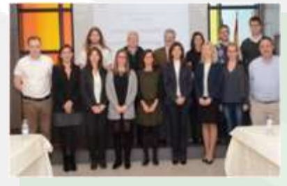
The “Green Skills” team, during the kick-off meeting in Alzira, Spain